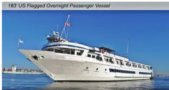
183' US Flagged Overnight Passenger Vessel